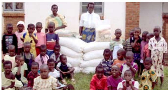
MUMs feeding programme in Likuni.

Welcome to our second newsletter – an update of how MUMS is helping the lives of women and children in the Lilongwe area in Malawi.